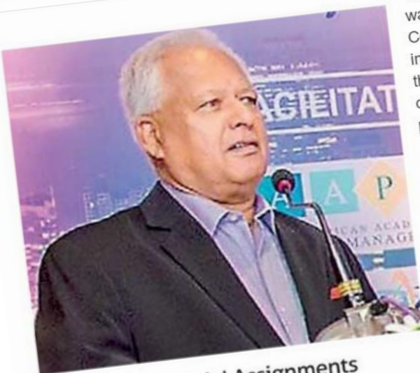
Chief guest Special Assignments Minister Dr. Sarath Amunugama addressing the gathering at the forum

The Asia-Pacific Executives Forum was recently held at the Hilton Colombo with the participation of important dignitaries and the focus of the forum was on strategic development projects in Sri Lanka and promoting them globally.