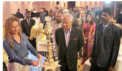
Lighting of Oil Lamp - AAPM November 2017 Milestone

Congrats to the 1 st Asia-Pacific Executives Forum - Hilton Hotel, Colombo. The Forum focused on strategic development of projects in Sri Lanka and promoting them internationally. AAPM facilitated this partnership with local and overseas institutions. Minister Dr. Sarath Amunugama was the chief guest. The conclusion of the Forum was dedicated to AAPM Certification Awarding. Visit the highlights and guest speakers of this forum http://apeforum.org